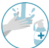
Wash hands frequently with soap and water or use a sanitiser gel

What should I do to prevent catching and spreading the virus?