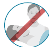
Avoid close contact with people who are unwell