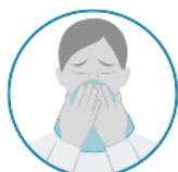
Catch coughs and sneezes with disposable tissues