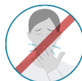
Avoid touching your eyes, nose and mouth with unwashed hands