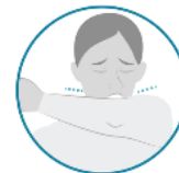
If you don't have a tissue use your sleeve