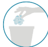
Throw away used tissues (then wash hands)